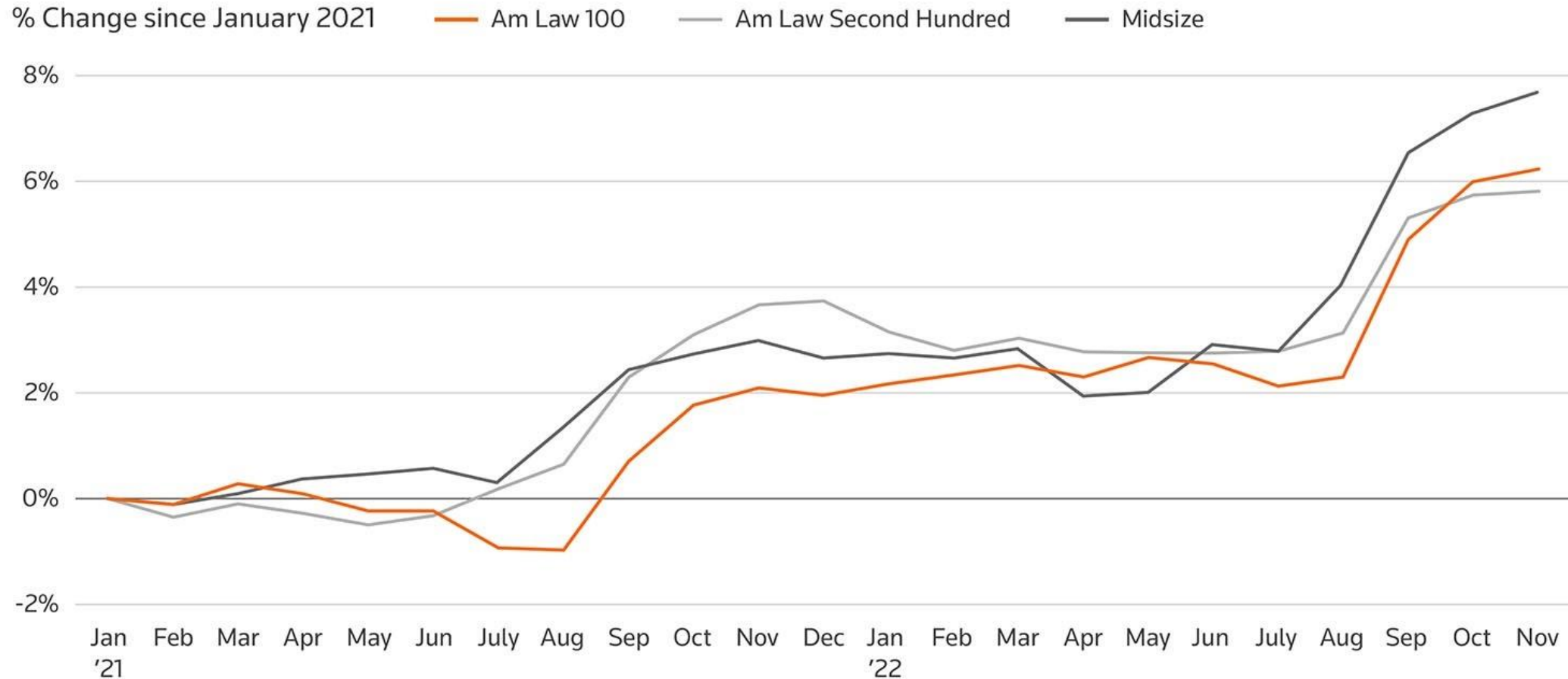
Figure 10: Lawyer (FTE) growth by segment

Percentages measures change from each point against Jan 2021 headcount to show change while ignoring baseline effects.